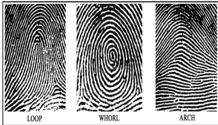
Fig. 2. Three basic fingers print ridge patterns

D. Fingerprint Pattern: What are the types of fingerprint templates? There are many descriptions and descriptions of fingerprint patterns but Joannes Evanelista Purkinje discusses the function of the grooves and ridge holes in detail in that part of his article. He also described and explained 9 fingerprint patterns (1 arc 1 tent 2 rings 5 spirals) [23]. Purkinje made important observations about the four basic modes but the authors [19] of these observations focused on three basic modes by excluding only the tentacles in their study.